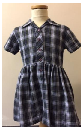
GIRLS SUMMER UNIFORM