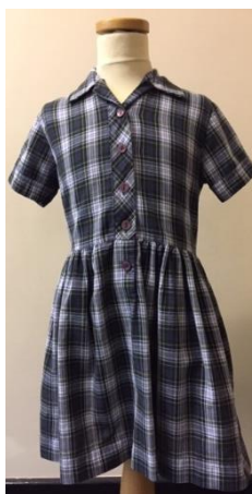
GIRLS SUMMER UNIFORM