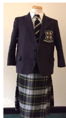
GIRLS WINTER UNIFORM