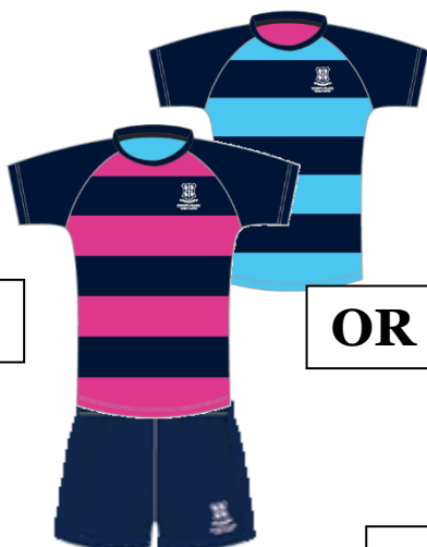
REVERSIBLE TOP & RUGBY SHORTS