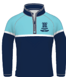
BOY & GIRL