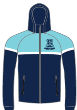
BOY & GIRL WATERPROOF JACKET