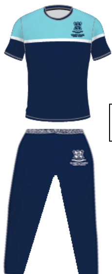
BOY & GIRL