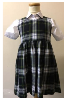
GIRLS WINTER UNIFORM