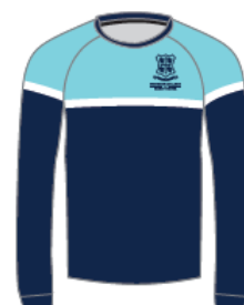
RUGBY SPRAY TOP