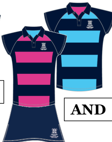
GIRLS REVERSIBLE TOP & SKORT