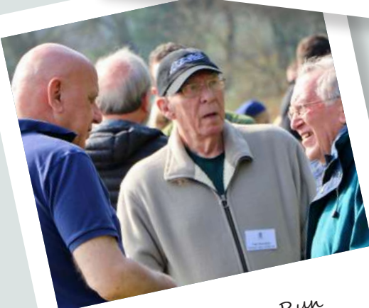
The OW Dorm Run