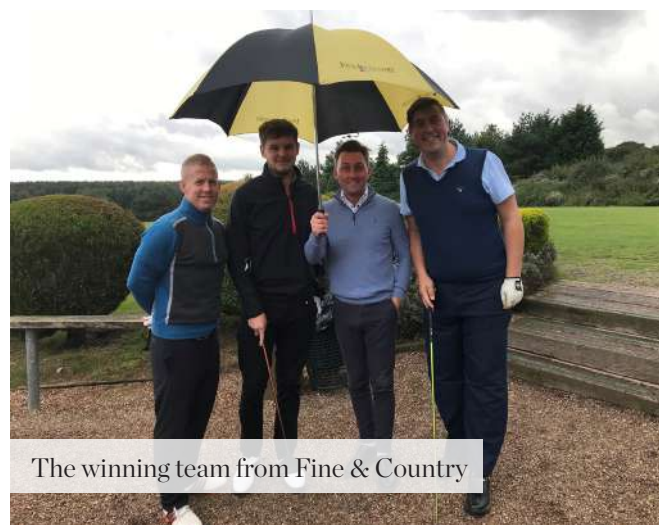
The winning team from Fine & Country