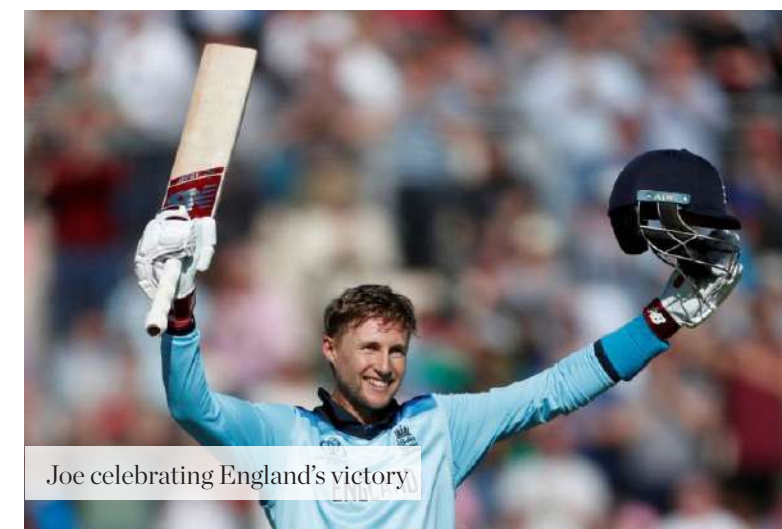
Joe celebrating England's victory

Joe Root has certainly laid the foundations for cricket here at Worksop and we are delighted to announce that, as of April 2020, we will be the first girls' cricket development centre in Nottinghamshire, in association with Notts County Cricket Club.