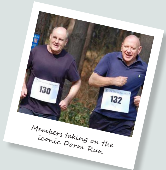
Members taking on the iconic Dorm Run